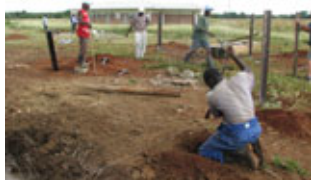
Preparing a place where cattle will be waiting before being milked.

Our Community Orphan Care Programme (COCP), which has 105 children, is going on very well. It is of concern to us that World Vision, the organization that has been donating towards this program, will be ending their support this month. Please pray that God blesses them for the wonderful work they have been doing.