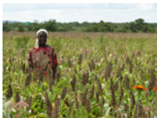
Part of the field

Our Community Orphan Care Programme (COCP), which has 105 children, is going on very well. It is of concern to us that World Vision, the organization that has been donating towards this program, will be ending their support this month. Please pray that God blesses them for the wonderful work they have been doing.