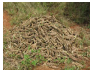
Some of the harvested grains

Thank you very much for all your prayers. May God richly bless you.