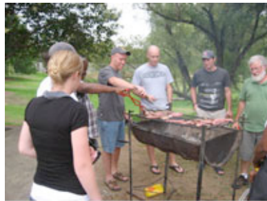
Christ in Youth group at National Youth Seminar braai (BBQ)