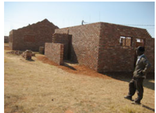
Toilet Block at the Tigane Church of Christ