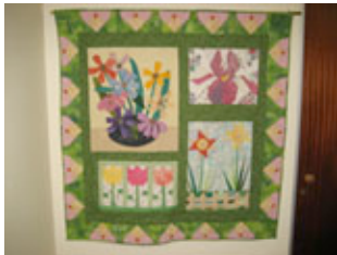
Quilt made recently by the Ellerine's Community Development Centre Quilt class