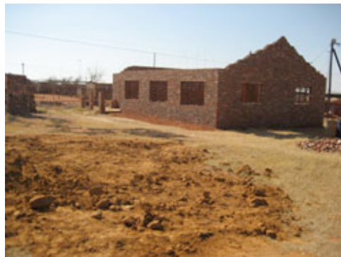
House at Tigane

The minister’s house and toilet block continue to rise at the township of Tigane. Paul takes the two and a half hour drive each week to check on the construction, buy the materials needed, and pay the wages of the workers.