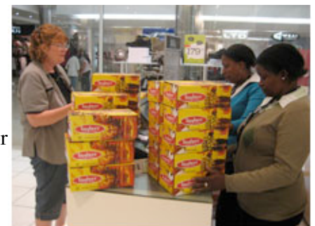
School/Church shoes for KCV kids

The political situation in Zimbabwe after the election on March 29th is still not resolved. The economic situation worsens each day. We were dealing in billions of dollars, which was mind-boggling. The US dollar while we were there was worth 100 million Zimbabwe dollars. It is worth more now. The people of Zimbabwe need our prayers.