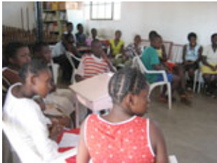
Sunday Afternoon Youth Meeting at KCV