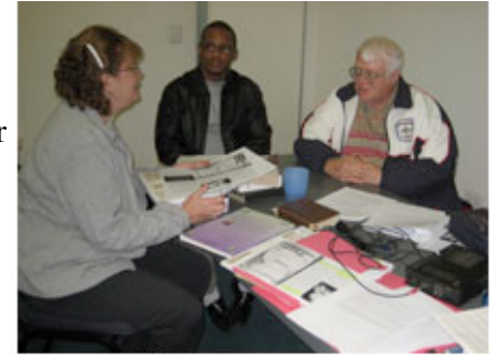
The new song workshop/worship class

In the past I have traveled to Kimberly to teach an intensive course at SABI (South Africa Bible Institute) for two weeks. But due to scheduling I will not be able to travel this year. So two of the instructors will be coming to Alberton on Saturday and Sunday, May 17th and 18th, and I will teach them the course so they can teach the students. The worship course deals with different areas of worship and focuses on how to compose worship songs in the student's indigenous languages.