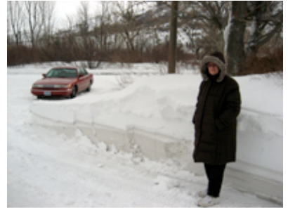
From sunshine in Africa to snow in Oregon