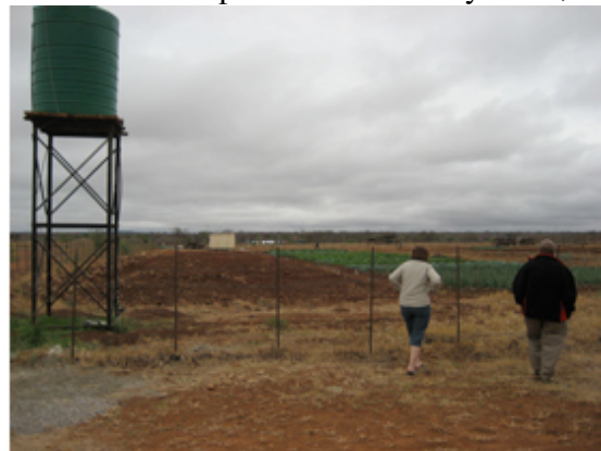
A water tank at KCV similar to the one put up for the orchard

The KCV church is doing very well. Programs such as Sunday school, junior worship, youth group, women's fellowship, men's fellowship and church choir are being carried out. Five individuals have been baptized within the past three weeks. We praise God for the good work He is doing for KCV.