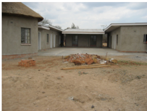
Second Australian house under construction

The children had a wonderful Christmas and a blessed New Year. Thanks to you all for your prayers and Christmas presents.